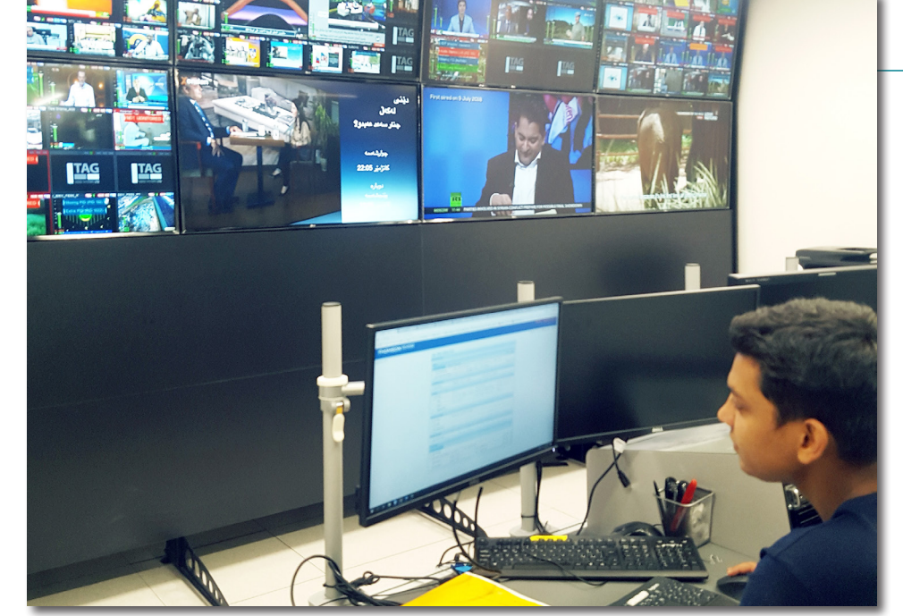
Media-centric companies see their top opportunities in the Internet of Things (IoT), Over the Top (OTT) video distribution, cloud services, aeronautical service for passenger airlines and enterprise data and video networks.

executives conducted at the end of 2017. The survey was conducted at a time when the business environment in which teleport operators work is being disrupted by technology and market change. Their established businesses face disruption from new models of connectivity (HTS, MEO and LEO), by the rising domination of software over hardware, and customer demands for seamless global service. They are disrupting their own operations by innovating up the value chain to meet new customer needs, which requires a new depth of technology knowledge and strong management skills.